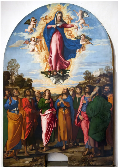
Assumption of the Virgin Palma Vecchio (1480-1528)